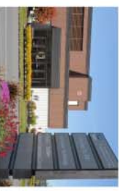
Network Operations Center